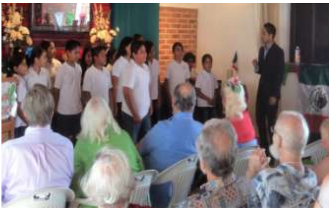
The San Juan Cosala Children's Choir sing Mexican songs for us. (September 18 th )