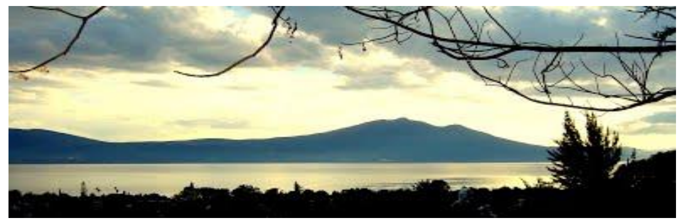
LAKE CHAPALA UNITARIAN UNIVERSALIST FELLOWSHIP NEWSLETTER NOVEMBER 2018