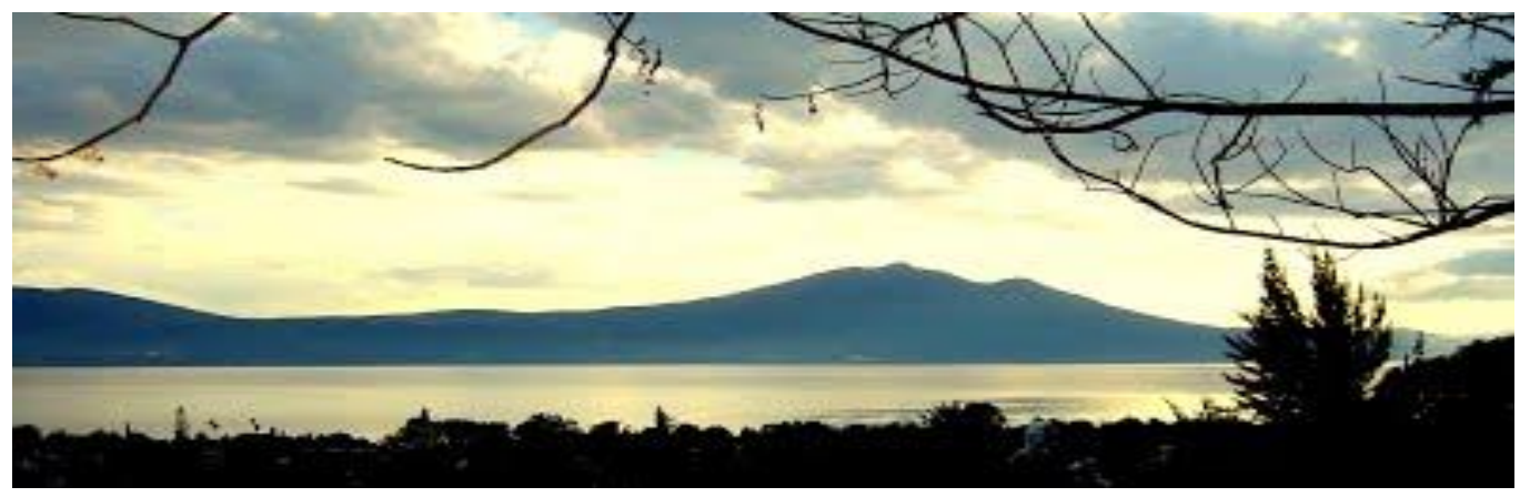
LAKE CHAPALA UNITARIAN UNIVERSALIST FELLOWSHIP NEWSLETTER APRIL 2019