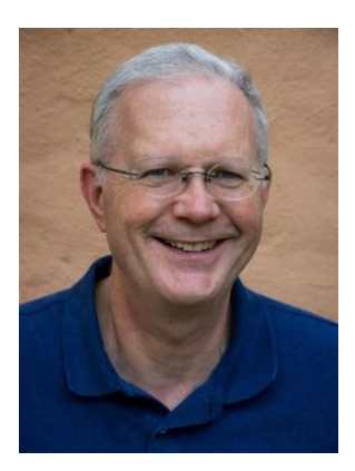
MESSAGE FROM REV. MATT

I don't think of myself as strongly intuitive, but I am picking up on the energy around the Fellowship in the last few months and it is positive! There seems to be positive excitement in the air, people seem to really enjoy being part of our congregation.