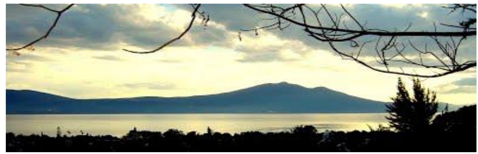
LAKE CHAPALA UU FELLOWSHIP NEWSLETTER - OCTOBER 2019