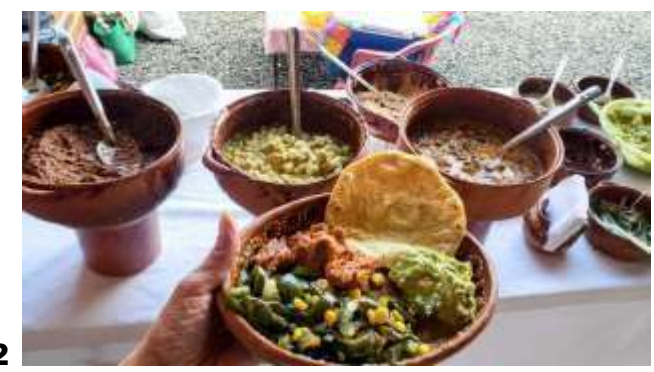
TACO PARTY 12/31/22