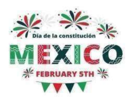
February 5<sup>th</sup> – Mexican Constitution Day