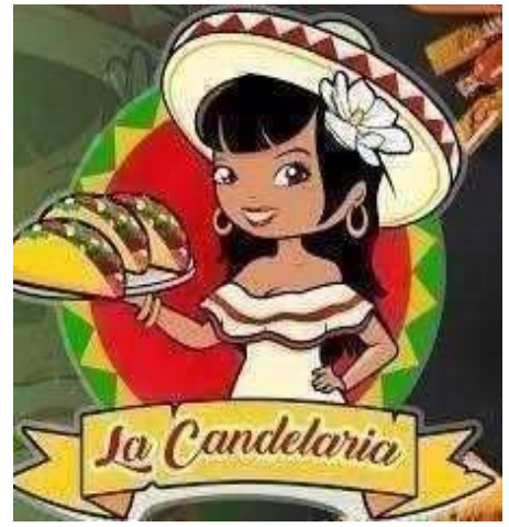
February 2<sup>nd</sup> – Die de la Candelaría

Elsewhere? Find your local phone number: https://us04web.zoom.us/u/fnTR4N3JJ We encourage you to try to connect early, to get things set up. However, you won't be able to join the service until about 10:00am on Sunday.