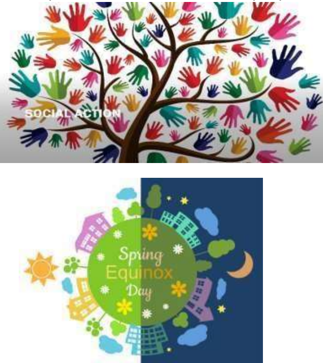
Spring Equinox – March 20th